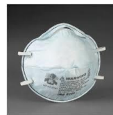
Filtering facepiece, dust mask