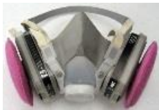
Elastomeric air purifying respirator

Employees may express a desire to wear a respirator when performing tasks that do not require respiratory protection. Employees will make their desire known to their supervisors. The supervisor with the assistance of EH & S will review the request for approval by ensuring that the employees' health or safety will not be jeopardized. The "Voluntary Use Form" must be signed and kept on file with their supervisors or with EH & S. Any employee who voluntarily wears a NIOSH approved elastomeric respirator (reusable) when a respirator is not required is subject to the medical evaluation, cleaning, maintenance, and storage elements of this program, and must be provided with "Voluntary Use Form". ("Information for Employees Using Respirators When Not Required Under the Standard"). When a filtering facepiece (dust mask) is chosen voluntarily, precautions must be taken to ensure that the limitations of the dust mask are understood and that these masks are to be disposed of properly after use. Dust masks protect against dust particulates such as wood dust, pollen, or nuisance dust. In a health care setting, workers use them to protect against aerosolized droplets released from sick patients. Dust masks are not to be shared between users; discard the mask if it becomes soiled, difficult to breathe, or it becomes damp. Do not store for reuse.