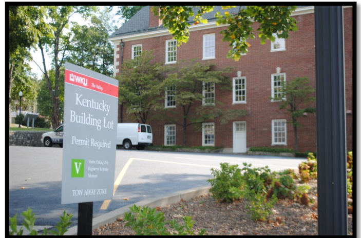
KY Bldg. Lot Visitor Parking