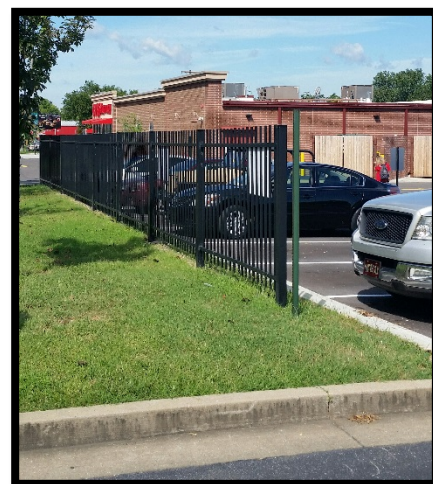
Adams Street Visitor Parking