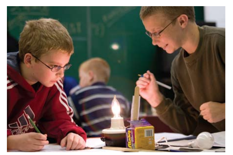
Super Saturdays students

the Summer Program for Verbally and Mathematically Precocious Youth (VAMPY), hosted since 1984 in cooperation with the Duke Talent Identification program. In addition, The Center also runs the Summer Camp for Academically Talented Middle School Students (SCATS), and during the academic year, coordinates Super Saturdays, which allow gifted students in grades one through eight a chance to learn outside of the regular classroom setting. It is the SCATS camp which serves as the setting for the practicum required of those graduate students working toward a gifted certification.