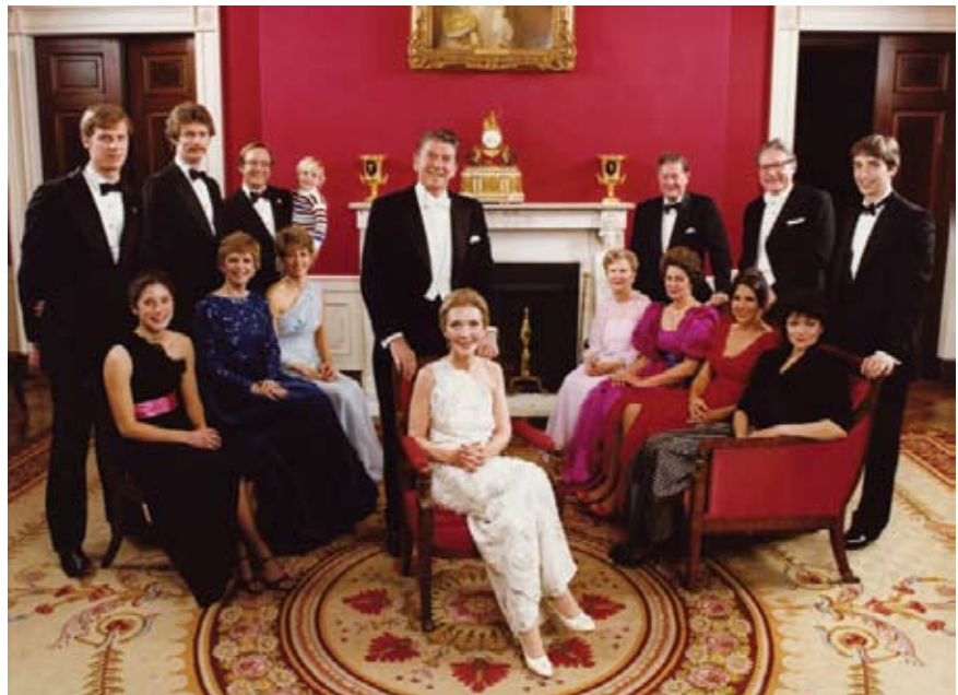
1981 Inaugural Family Photo