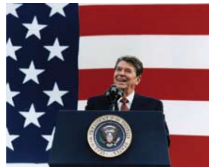
President Reagan at a Reagan-Bush Rally in Endicott, New York