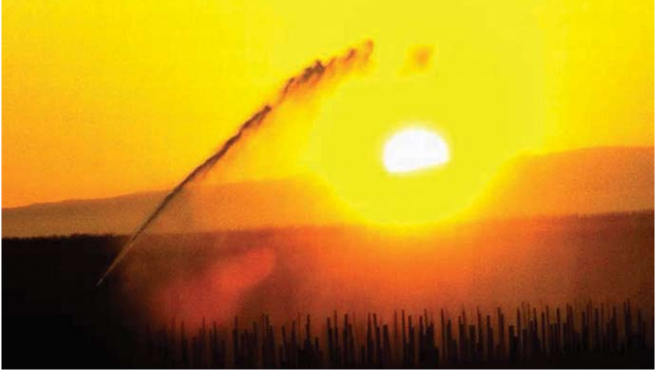
Daytime temperatures are slightly lower in irrigated areas compared to non-irrigated areas

“Teaching and research go hand in hand,” he said. “I’m able to use data collected from my research projects in classroom lectures and that’s very beneficial for students.”