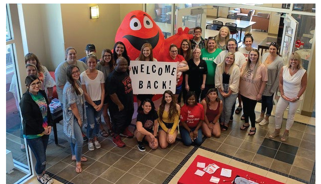
Current BSW students from the Owensboro regional campus.

We are enthusiastic for what the future holds for the BSW program at WKU and are grateful to our support staff and student workers, our adjunct faculty, and our field Instructors and task supervisors (some of whom are our graduates!) for their indispensable contributions to our program. Without them, the BSW program would not be as successful and vibrant as it is today!