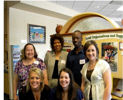
Above, the Family Resource Program staff and interns at the Vanderbilt Kennedy Center.

The group explored the Monroe Carrell Jr. Children’s Hospital at Vanderbilt and engaged in a discussion with staff at the Junior League of Nashville Family Resource Center. The program provides information to help families understand a child’s medical condition, as well as information about community agencies and support programs.